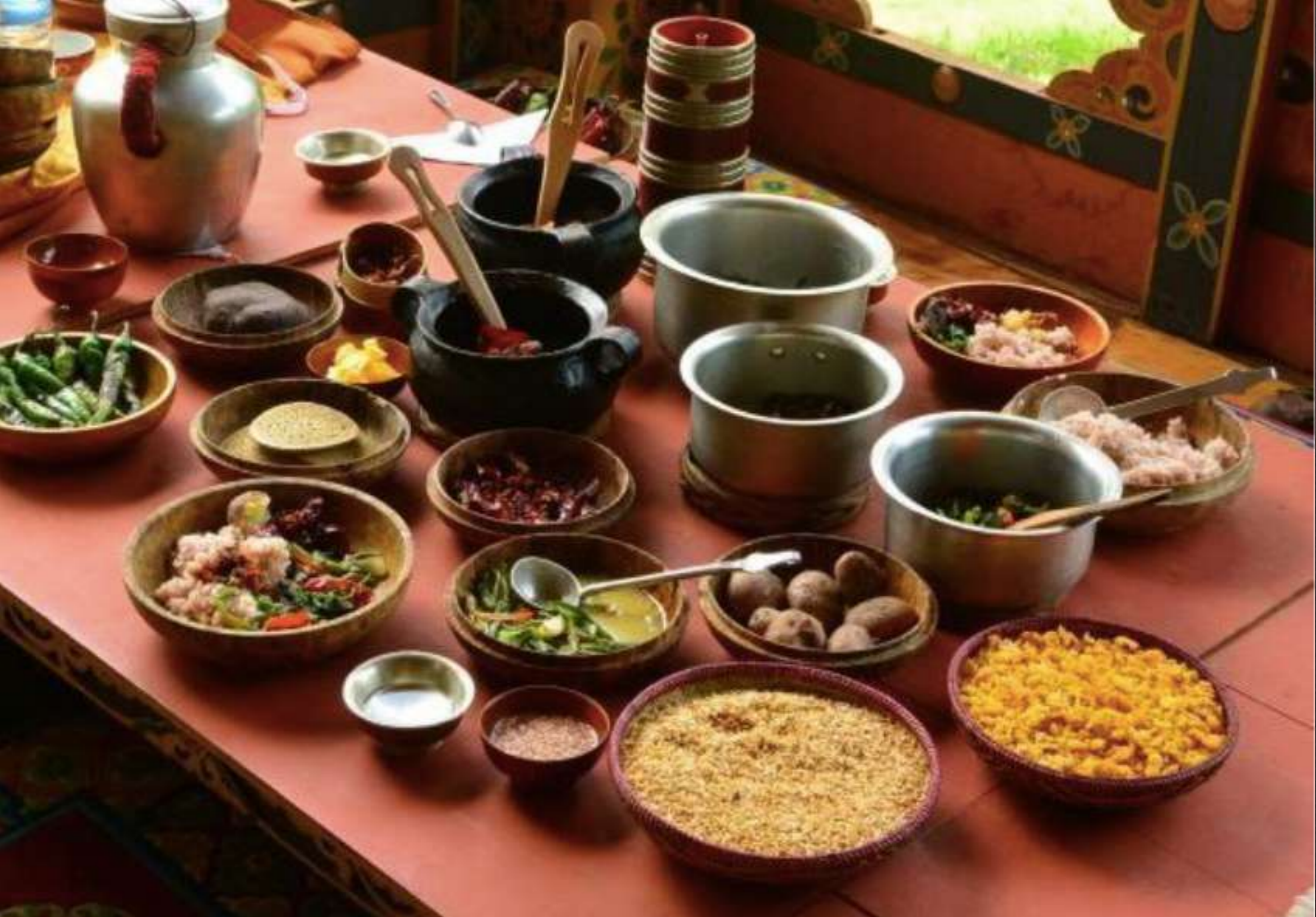
Enjoy the best Bhutan has to offer—from local eats to Asian fusions and award-winning dining experiences.